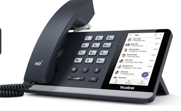
4.3-inch Multitouch Screen